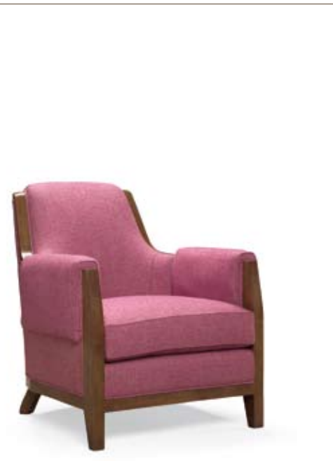
7006 SADDLE BAG LOUNGE DIMENSIONS: 29"W 37"D 37"H ARM HEIGHT: 26"H WOOD: WALNUT