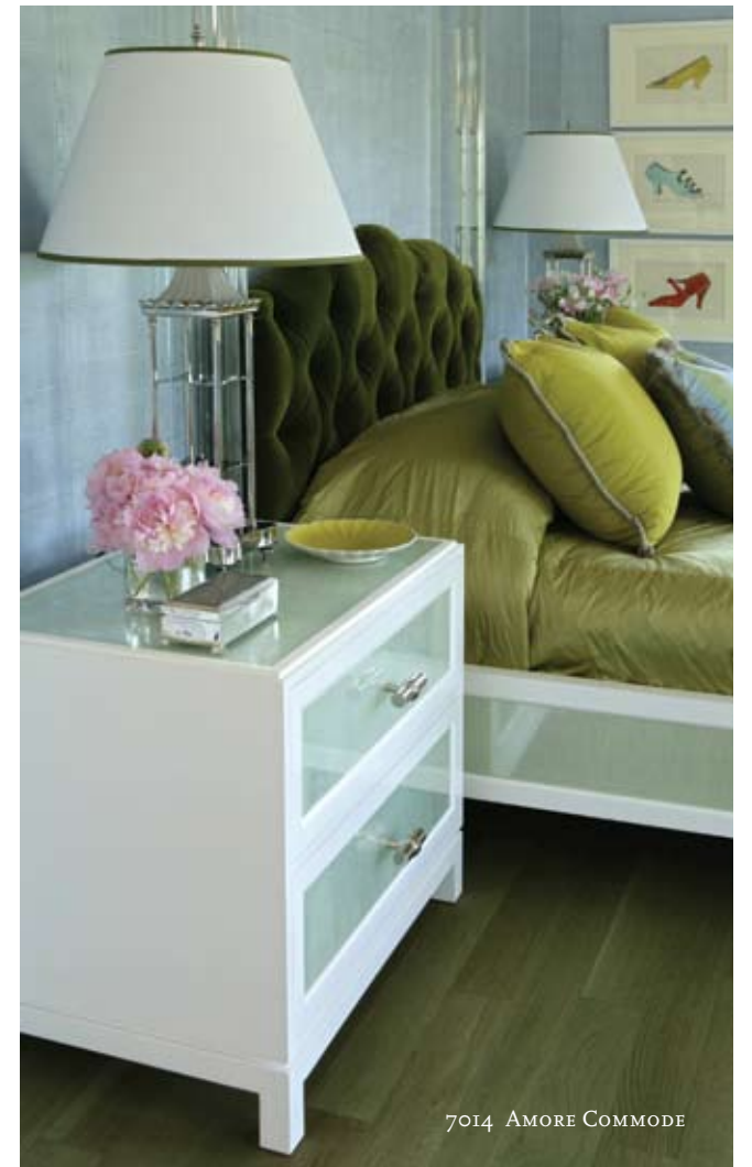
7014 AMORE COMMODE