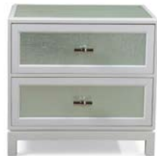
7014 AMORE COMMODE 30"W 21"D 28"H