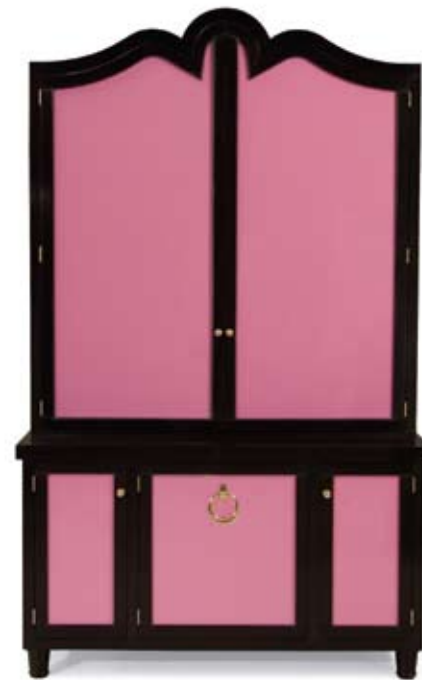
7017 PROVENCAL CABINET 54"W 21"D 90"H CUSTOM FINISHES AVAILABLE