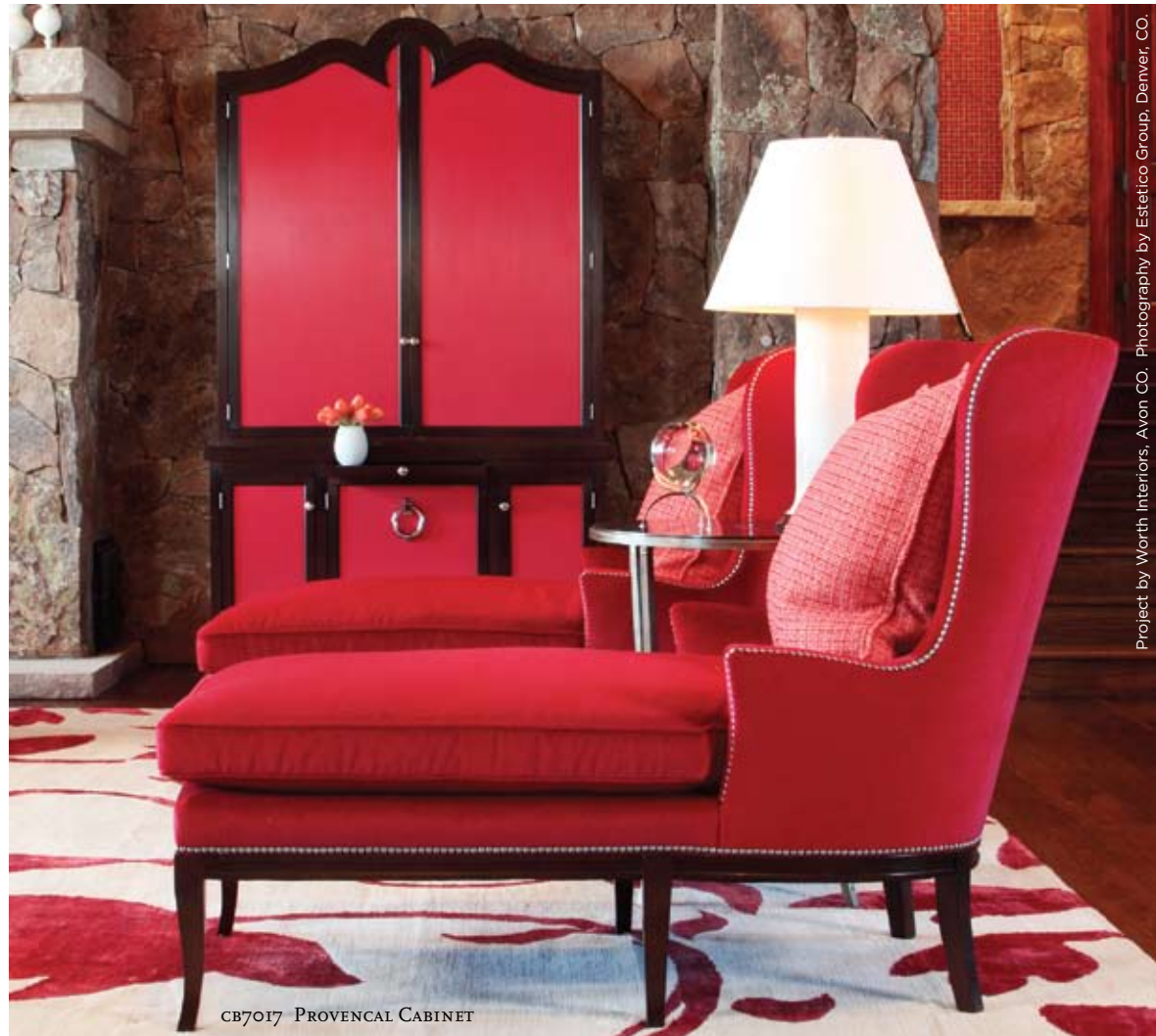
CB7017 PROVENCAL CABINET

Project by Worth Interiors, Avon CO.