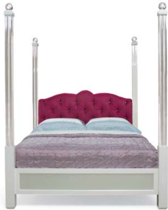
7013 AMORE 4 POST BED POST HEIGHT: 84"H / HEAD BOARD: 51"H AVAILABLE IN QUEEN AND KING