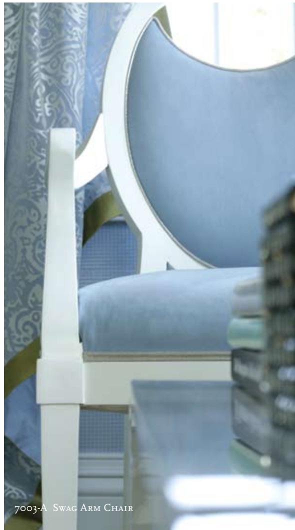
7003-A SWAG ARM CHAIR