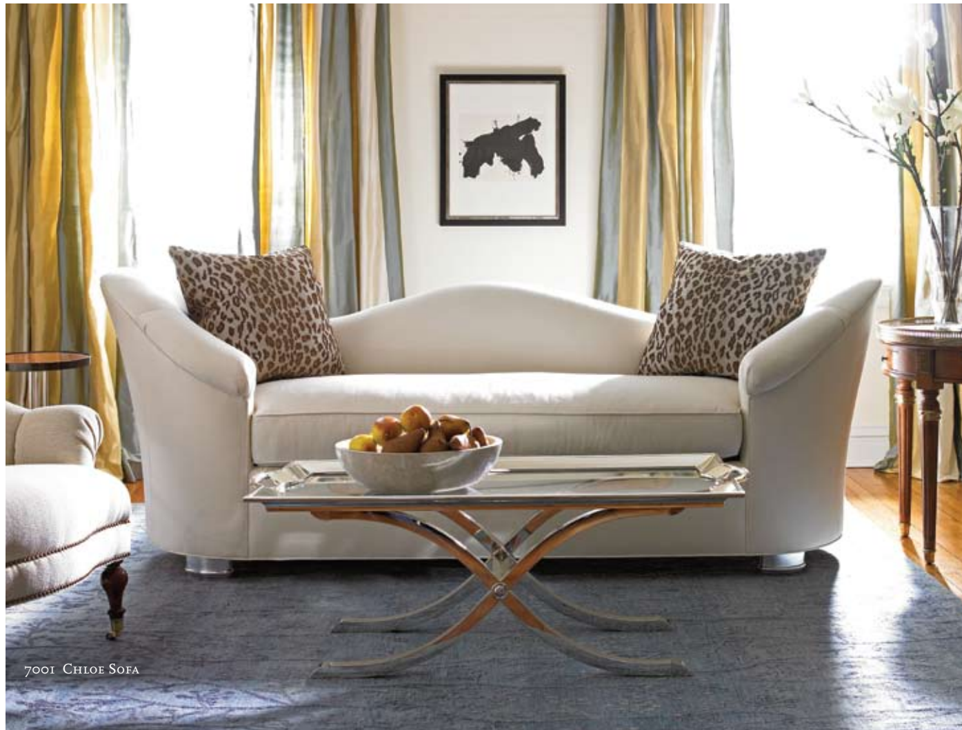
7001 CHLOE SOFA