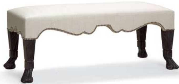
7016 BAROQUE BENCH 48"W 21"D 18"H

For a current list of Corporate, Boutique and Representative Showrooms visit the Showroom Locations portion of our website.