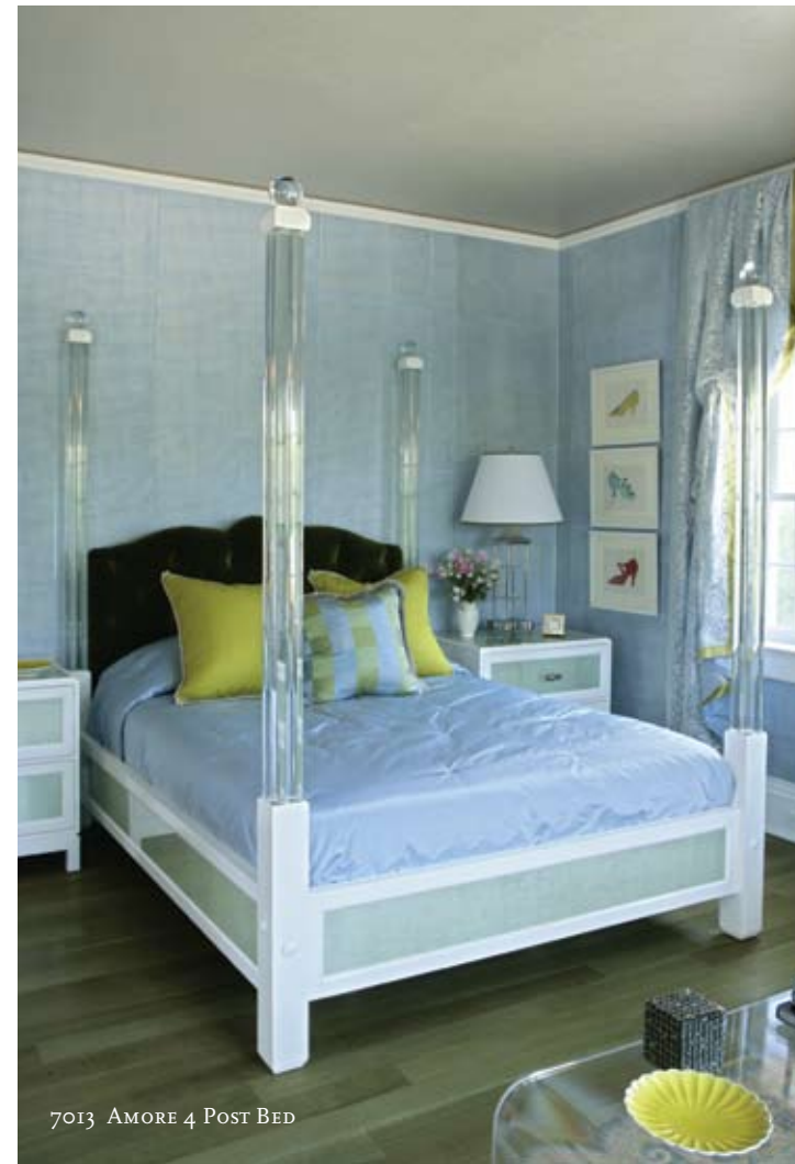
7013 AMORE 4 POST BED