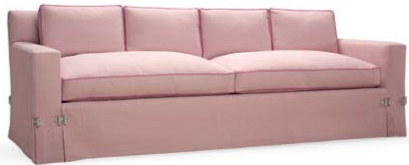
7002-98 TAILLEUR SOFA 98"W 39"D 33"H ARM HEIGHT: 25 1/2"H