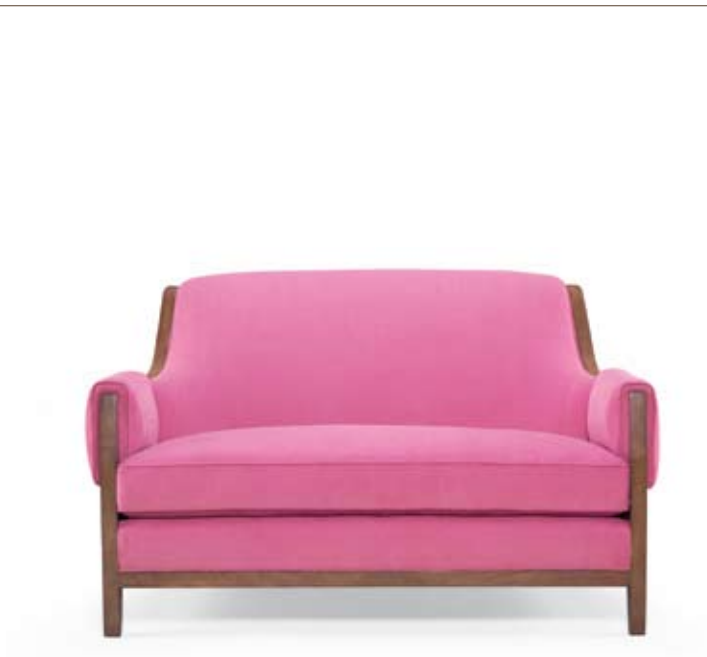
7007 SADDLE BAG SOFA DIMENSIONS: 58"W 40"D 37"H ARM HEIGHT: 26"H WOOD: WALNUT

Project by Worth Interiors, Avon CO.