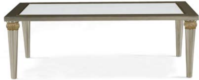
7008 MOON DUST COCKTAIL TABLE 48"W 30"D 18"H